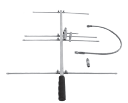
Pict. 1: DF Set

Peil-Set 301K - DF Set with directivity for the detection of spurious radiation